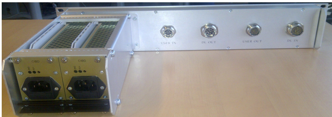
Figure 1: DLIB prototype